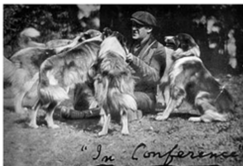
Terhune with His Collies, "In Conference."